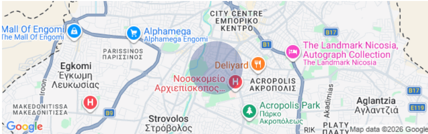
*Showing approximate location